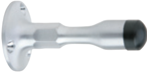
WS11 Meets ANSI/BHMA 156.16, L12011